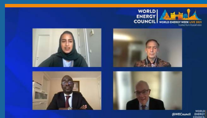
CIRCULAR CARBON ECONOMY IN THE MIDDLE EAST ▶