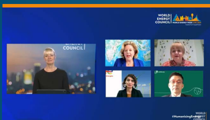
LEADERSHIP: THE CERTAINTY OF UNCERTAINTY ▶

World Energy Week LIVE 2021 is now available to watch on demand, please click on each session to view the recordings.