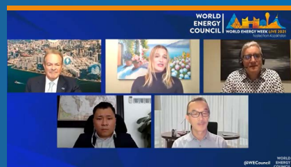
REGIONAL PERSPECTIVE: ASIA PACIFIC - FUTURE FUELS ▶