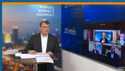
HYDROGEN: AVOIDING THE TROUBLE OF THE BUBBLE ▶