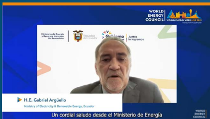
DECARBONISATION - THE LATIN AMERICA REALITY ▶