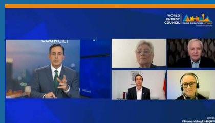
ENERGY FOR HUMANITY: ACHIEVING ABUNDANCE IN A WORLD OF SCARCITY ▶