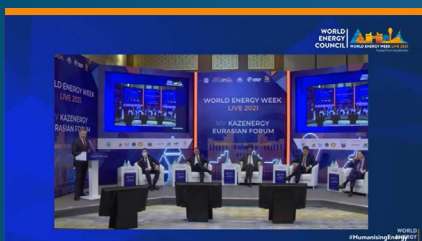
CARBON NEUTRALITY AND ENERGY FOR BETTER LIVES: NEW OPPORTUNITIES FOR KAZAKHSTAN ▶