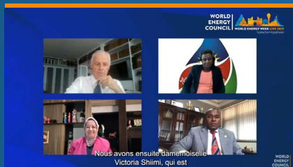
CAPACITY BUILDING FOR A NET-ZERO AFRICA ▶