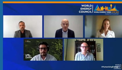
ACTIVE ENERGY CITIZENS: AT THE HEART OF THE ENERGY TRANSITION ▶