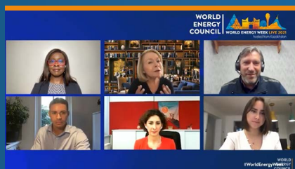
HUMANISING ENERGY: MEETING THE ENABLERS OF THE TRANSITION ▶