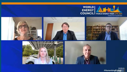
ENERGY TRANSITION AND COMPETITION FOR RESOURCES IN THE REGION ▶