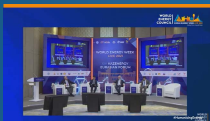
THE ENERGY INDUSTRY IN CENTRAL ASIA: NEW NATIONAL INITIATIVES AND PARTNERSHIPS ▶